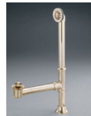
#2222 Waste & Overflow