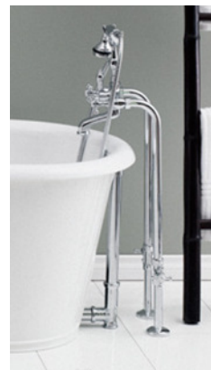
#3970 Heavy Duty Water Supply Lines