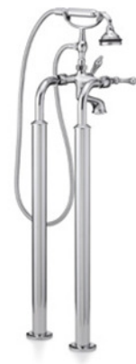
#3980 Heavy Duty Water Supply Lines